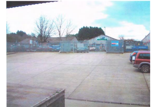
Photo taken prior to tenants occupation